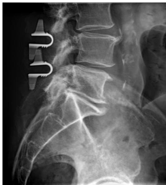
Lateral view x-ray of a two-level Coflex device implant

purpose with a low revision rate. Further investigation is required to determine what happened in the five revision cases that led to failure in the Coflex and what commonalities there are amongst the cases. This may help better describe the indications for Coflex instrumentation and lessen the amount of revisions amongst the general population.