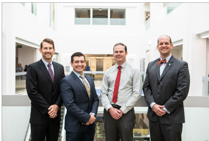
The HOI Fellowship Class of 2018

Hoag Orthopedics is a non-profit corporation founded by Hoag Orthopedic Institute physicians. The nonprofit exists to advance the field of orthopedics through research, education and community outreach. Funded by the generosity of the philanthropic community, the Hoag Orthopedics team supports the development of innovative research studies and the implementation of educational courses for medical professionals and for the local community.